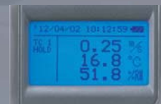
LCD display with bright backlight