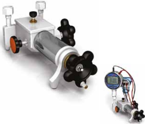
-12.5 psi to 6000 psi